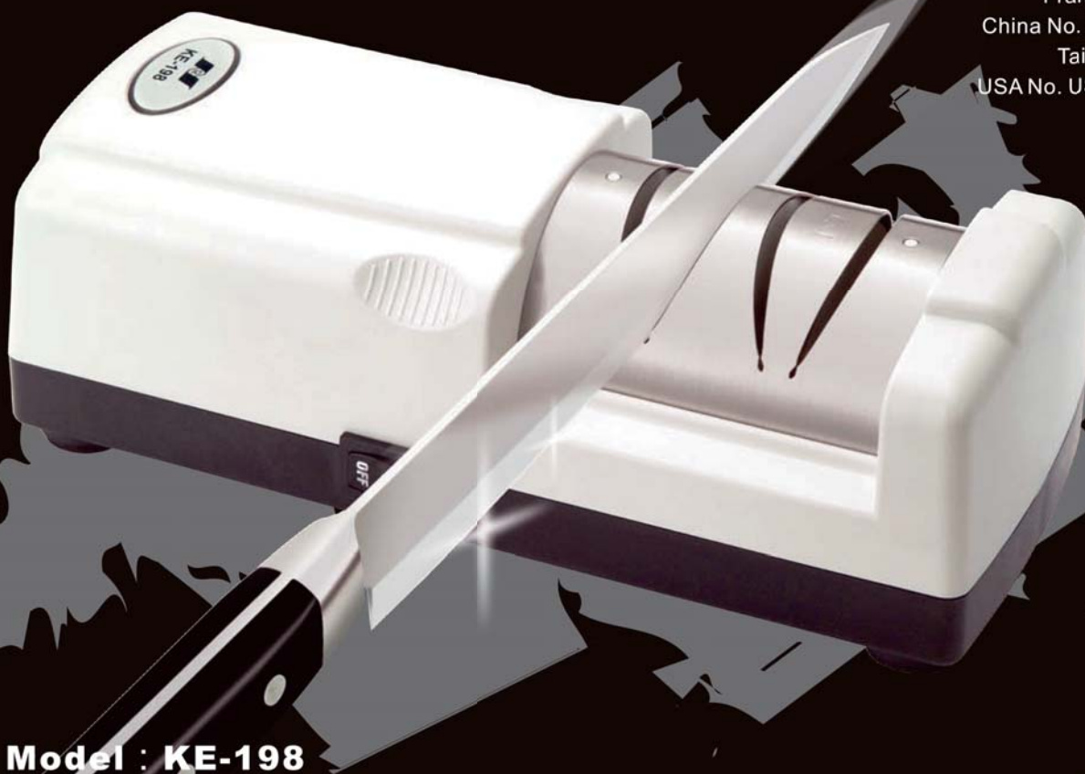
Model : KE-198

Patents obtained in Germany No. 20112057.7 France No. 0109734 China No. ZL 01 2 42939.2 Taiwan No. 221186 USA No. US 6, 932, 683 B2